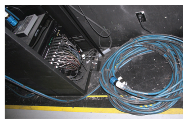
Optocore LX4AP 48 x 16 stage box

The Front of House LCS mixer has only three Optocore interfaces, because