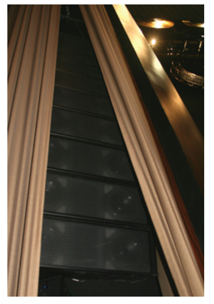
House left Meyer MICA array

The main console employs two TC Electronic M6000 reverbs for effects, one set up as four machines for drums, per-