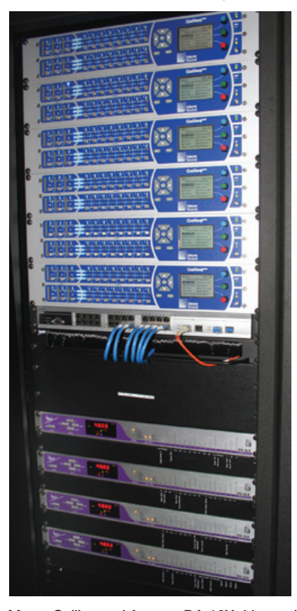
Meyer Galileo and Apogee DA-16X drive rack

Extensive coverage by the surround system is accomplished by four pairs of Meyer MSL-4, UPQ and UPJ on each side of the theater to cover far, mid and