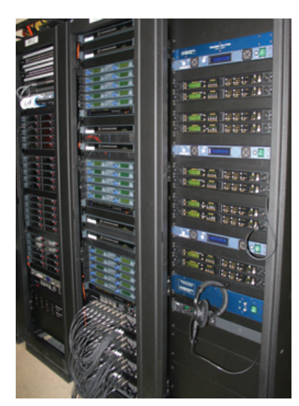
RF central: 40 mics, 30 IEMs & 10 BTR-800

Vall www.incimeanics.com in the US, call EUX-821-1121 in Canada, call EV7-738-9574