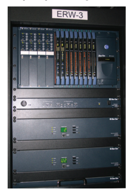
Clear-Com Eclipse-Median intercom